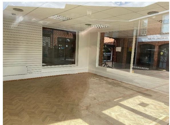
Internal Photos of the unit